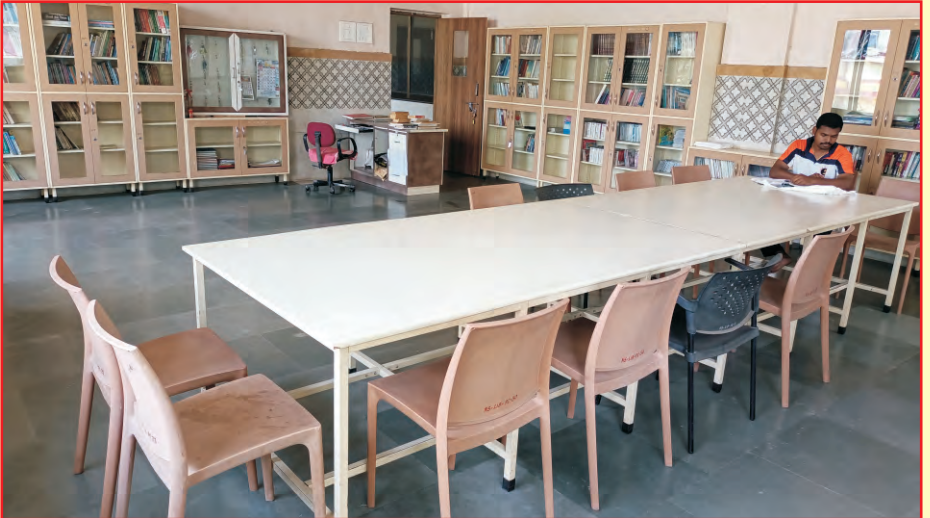
परिसरातील विद्यार्थी व नागरिकांना वाचनालयाची सोय