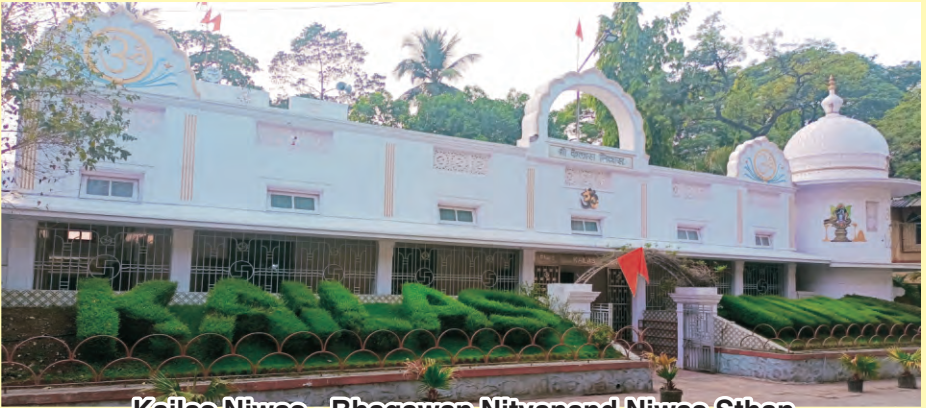
Kailas Niwas - Bhagawan Nityanand Niwas Sthan