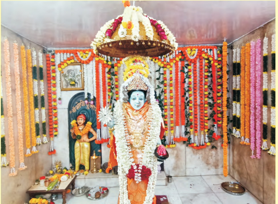
BHADRAKALI MATA MANDIR