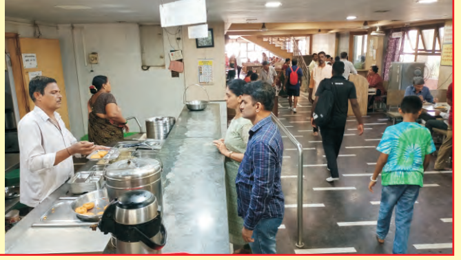
अन्नपुर्णा प्रसादालय - भाविकांसाठी अल्प दरात भोजन, अल्पोपहार व निवास