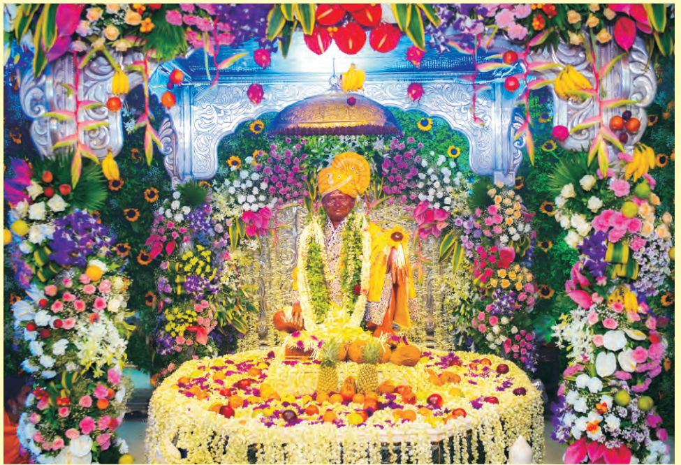
BHAGWAN SHRI NITYANAND BABA SAMADHI