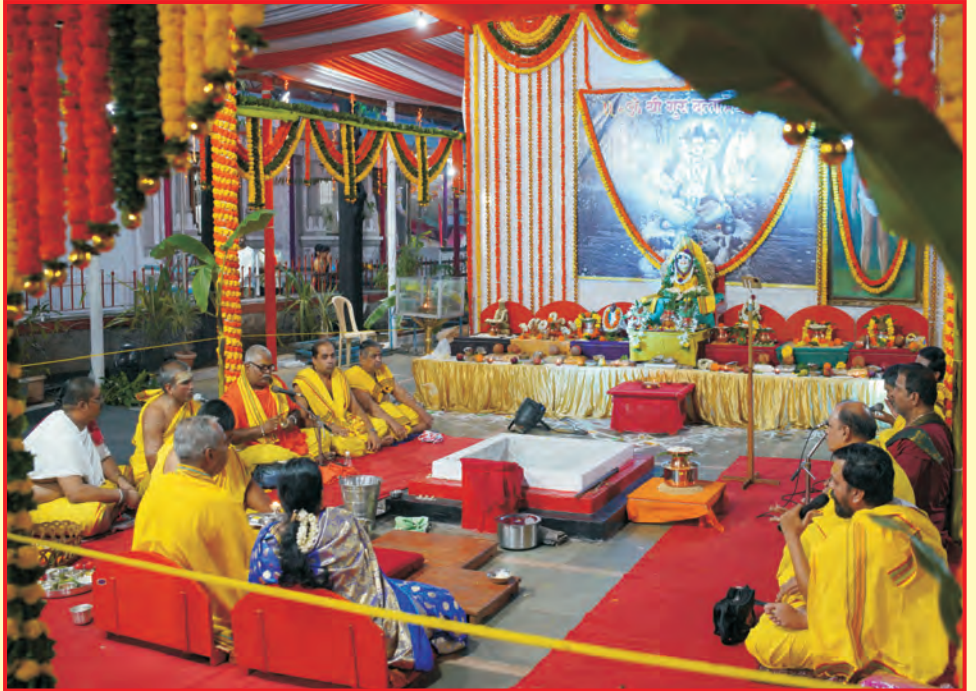
Hon'ble Trustee Mr. Sharad R. Pawar with Family Performing Pooja